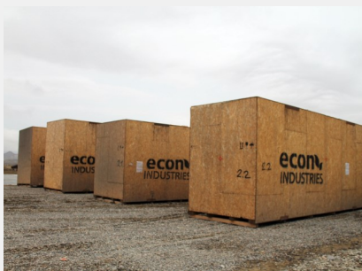
Shipping of 4 VacuDry® 12,000