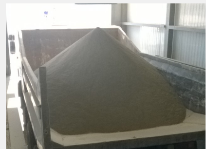
Output: Treated solids