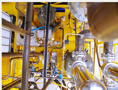
Condensation unit of VacuDry® plant