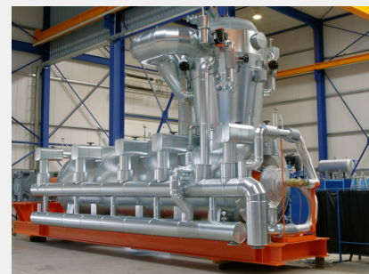
VacuDry® 12,000 dryer