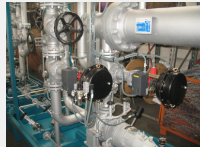
Detail of the thermal oil heating