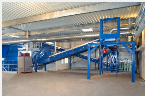
Position inside the building with conveying systems