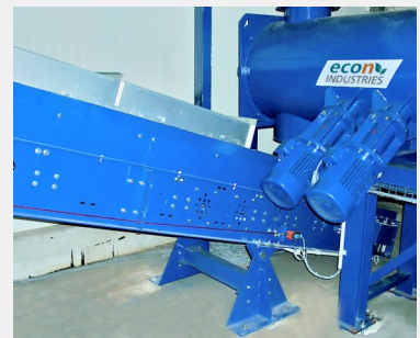
Direct conveying from discharge