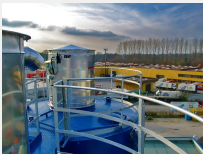
View from the silo bunker to the residual area