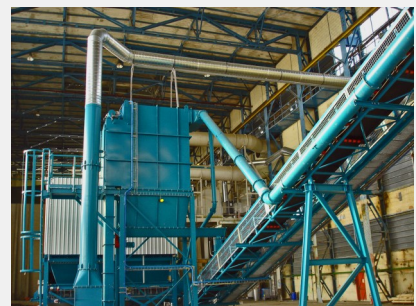
Preparation and feeding system of the plant