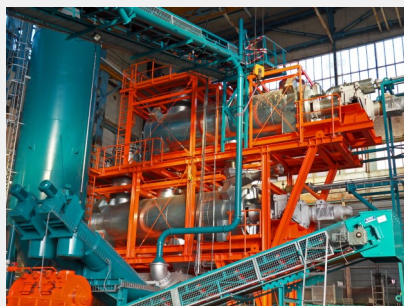
Front view of the VacuDry® plant