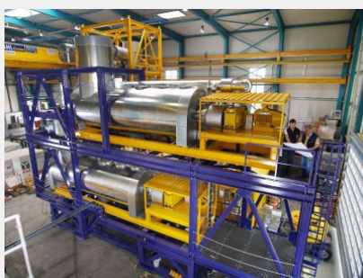
Front view of a VacuDry® plant